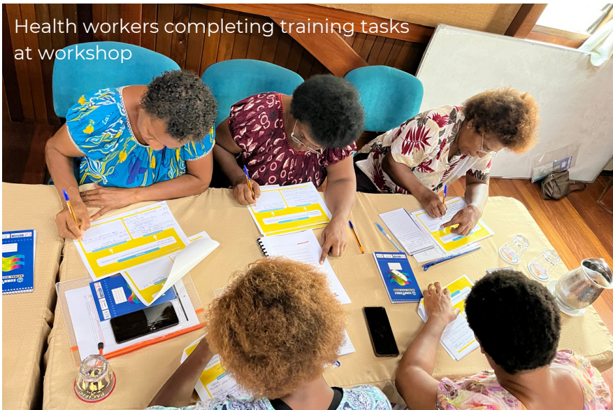
Health workers completing training tasks at workshop