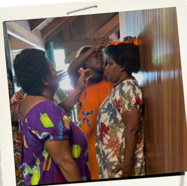
Testing a new height measurement device using ultrasound technology