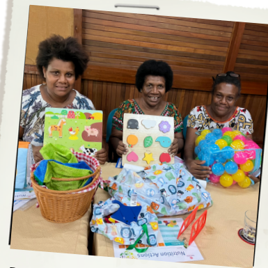
Participants from the Warangoi Rural Hospital with the educational toys provided to them to trial with their patients