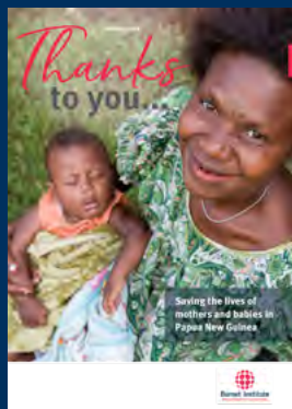
Cover: Your gifts are helping save the lives of mothers and babies in Papua New Guinea.